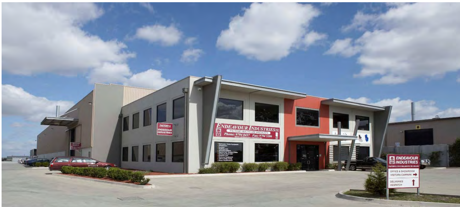
The Endeavour Industries office and showroom in Hallam, Victoria