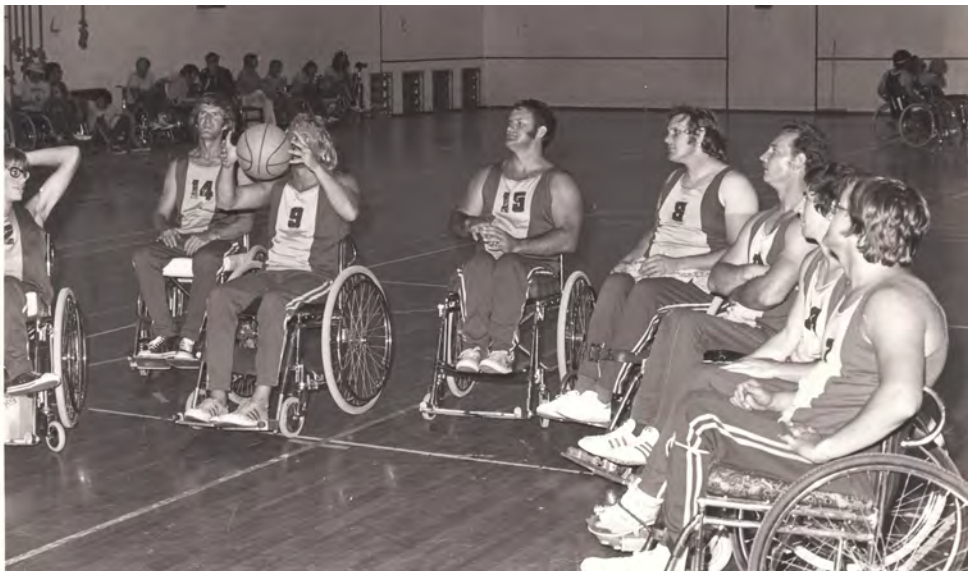
Basketball players in 1976 in Met-a-lite wheelchairs