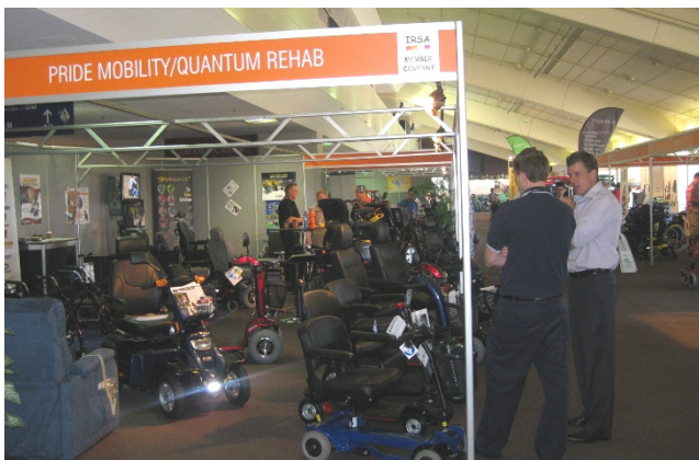
Pride Mobility - an IRSA Member Company