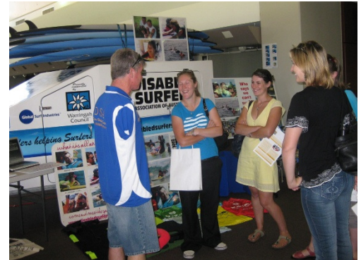
Disabled Surfers Australia - a crowd favourite

Many "not for profit" organisations used the Expo as an opportunity to engage with their members and raise their public profile. OT Australia, Spinal Cord Injuries Australia, the Spastic Centre, the ILC, PDCN and Northcott all enjoyed a very successful 3 days. The hit however seemed to be the team from Disabled Surfers Australia whose booth was always busy with people wanting to know more about this wonderful volunteer organisation.