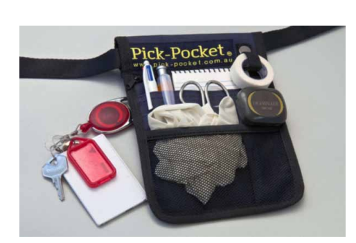
Pick-Pocket RRP $16.50. For more info, see <a href="https://www.pick-pocket.com.au">www.pick-pocket.com.au</a>

Assistive Technology suppliers have embraced the opportunity to showcase their latest equipment at Melbourne's second ATSA Daily Living Expo next year with 95% of the allocated booths already sold.